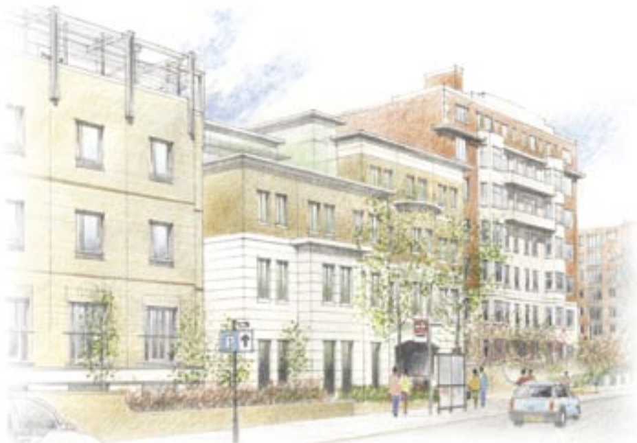
Artist's Impression of the Planned Circus Road Building

Westminster planners have given planning permission for the biggest expansion scheme at the Wellington Hospital since the opening of the North Tower in 1982.