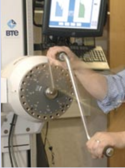
The Primus System